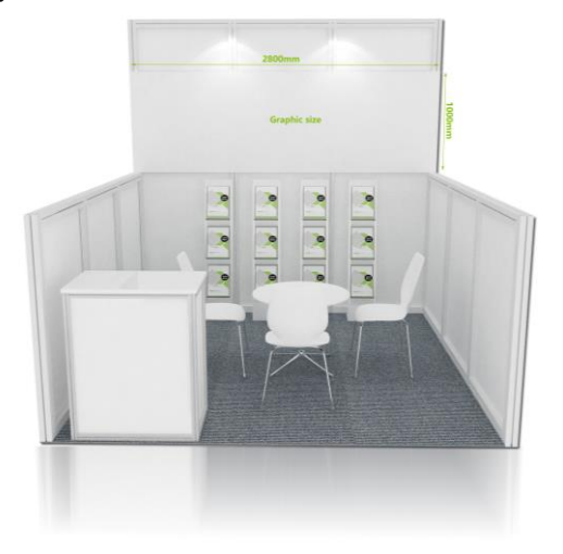
*Design layout for reference only