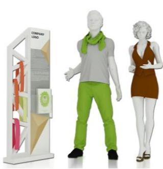
*Design layout for reference only